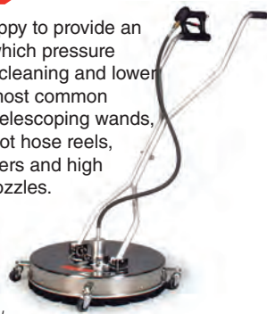
Optional Hose Reel Kit, Cart, Caster Wheel Kit and stainless steel base and cover